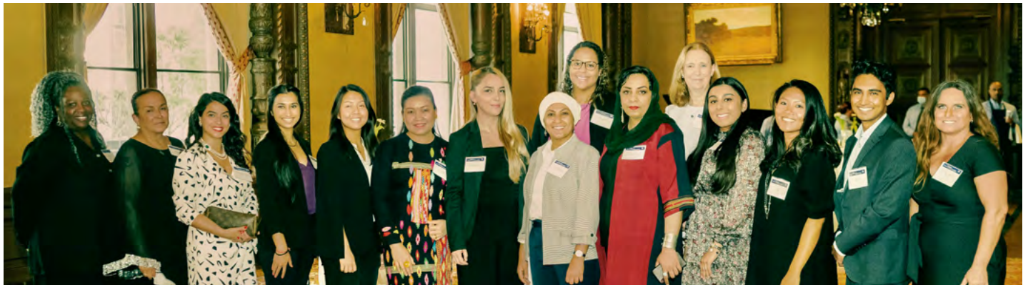
The International Women of Courage Alumnae with Deloitte Volunteers at the 2022 IWOC Celebration