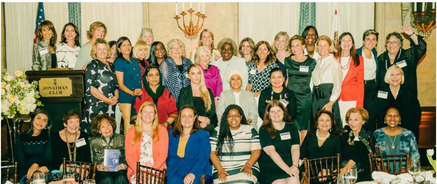
AWIU members, U.S. Department of State guests, and IWOC alumnae at the 2022 IWOC Celebration held in Los Angeles